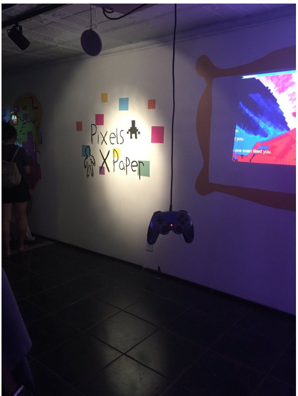
Pixels X Paper